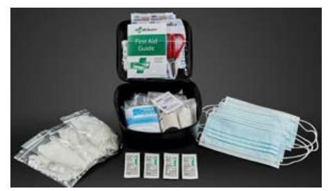
First aid kit with PPE