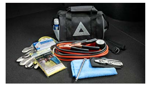
Emergency assistance kit