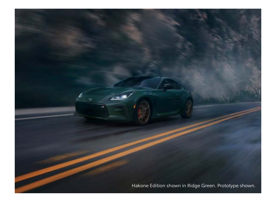
GR86 HAKONE EDITION