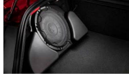
10-in. powered subwoofer