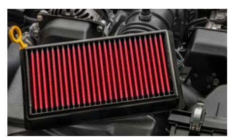
GR air filter