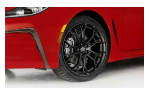
17-in. GR forged alloy wheels — bronze-colored

Now your GR86 can reflect your personal style. There's something for everyone. Some accessories may not be available in all regions of the country. For a complete list of accessories, go to toyota.com/gr86.