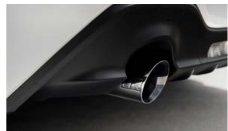
GR performance dual exhaust — chrome