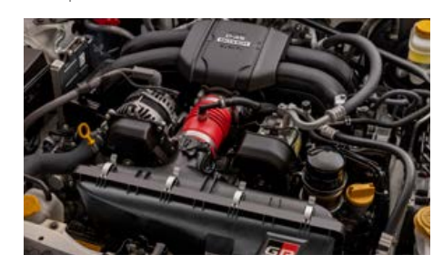
GR air intake system