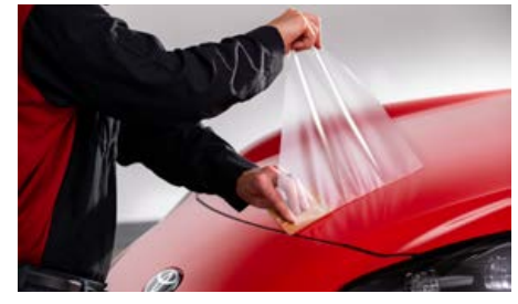
Paint protection kit<sup>32</sup>