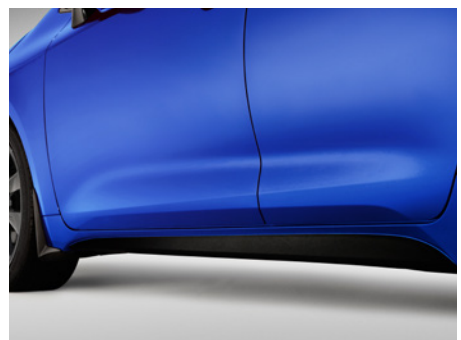
Lower rocker appliqué