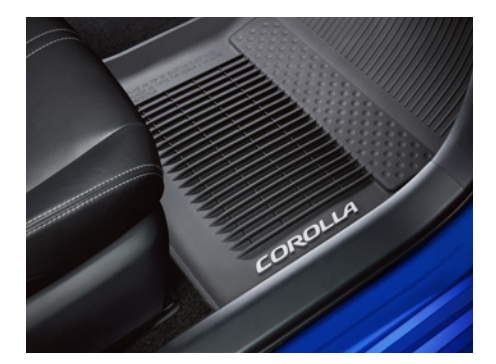
All-weather floor liners<sup>44</sup>

This is a great way to add extra personality to your Corolla Hatchback. Not every accessory is available in your area, so for a complete list of accessories, go to toyota.com/corollahatchback/accessories.