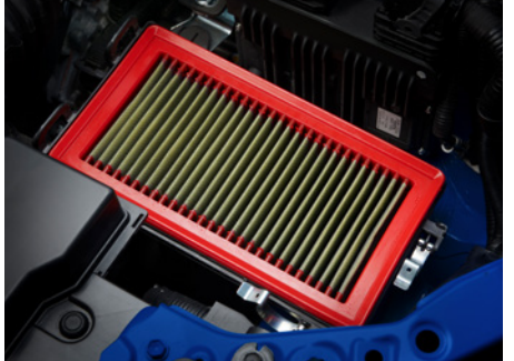
TRD air filter