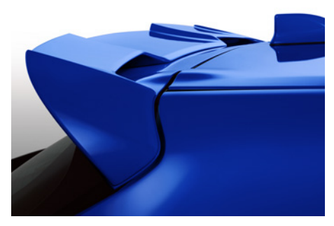
Vented sport wing