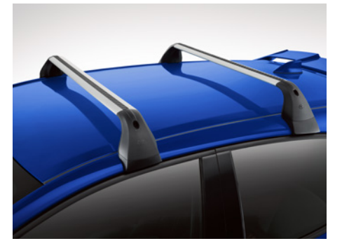
Removable cross bars<sup>45</sup>