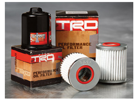
TRD oil filter