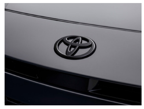
Blackout emblem overlays