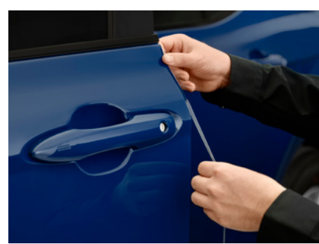
Door edge film