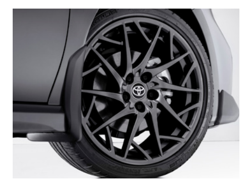
19-in. dark gray wheels

This is a great way to add extra personality to your Camry. Not every accessory is available in your area, so for a complete list of accessories, go to toyota.com/camry/accessories.