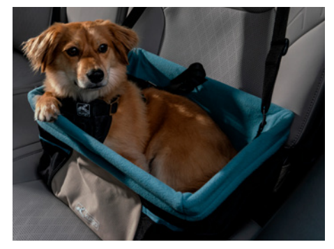
Kurgo® dog booster seat<sup>60,*</sup>