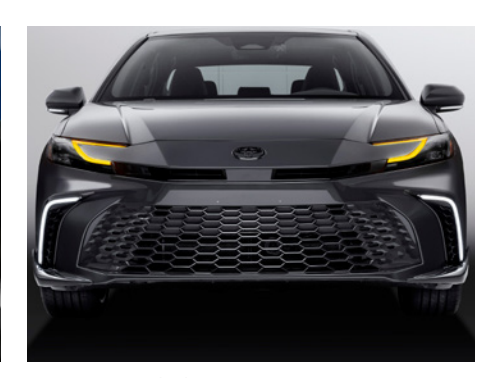
Front accent lighting