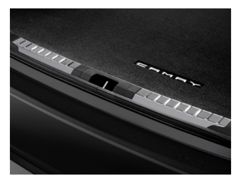
Illuminated trunk sill